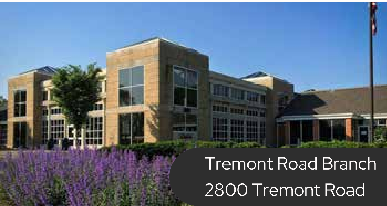
Tremont Road Branch 2800 Tremont Road