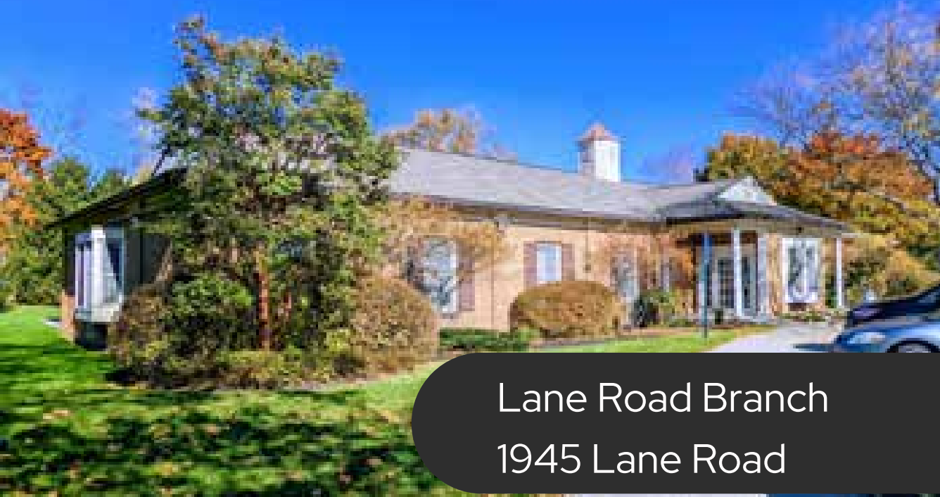
Lane Road Branch 1945 Lane Road